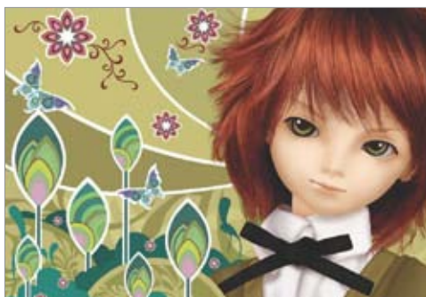
Influenced by Japanese illustrator – Aya Kato – Mak Tsuey Yi used Adobe Photoshop to draw this “doll”.