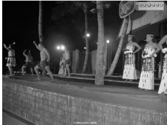
Figure 2: A controller is added to the slide show when the PDF file is created.

10 Preview the slide show. If you checked Open slideshow after export, the slide show opens in Adobe Reader. If the slide show doesn't open in Reader immediately, click the Open tool and open the file. The slide show opens in Full Screen mode and automatically changes slides at the interval you selected in the Export to Slideshow dialog. A controller appears in the upper-right corner (Figure 2), enabling you to pause, move back, and move forward among the slides.