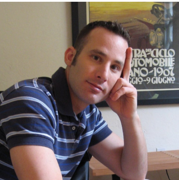
Image Line Productions edits the Robert Altman tribute for the Academy Awards using Adobe® Premiere® Pro software

The Academy Award is one of the most highly coveted honors in Hollywood. Given annually to recognize the past year's performances in film, the awards are presented during a ceremony where members of the Academy of Motion Picture Arts and Sciences announce the winners among their peers.