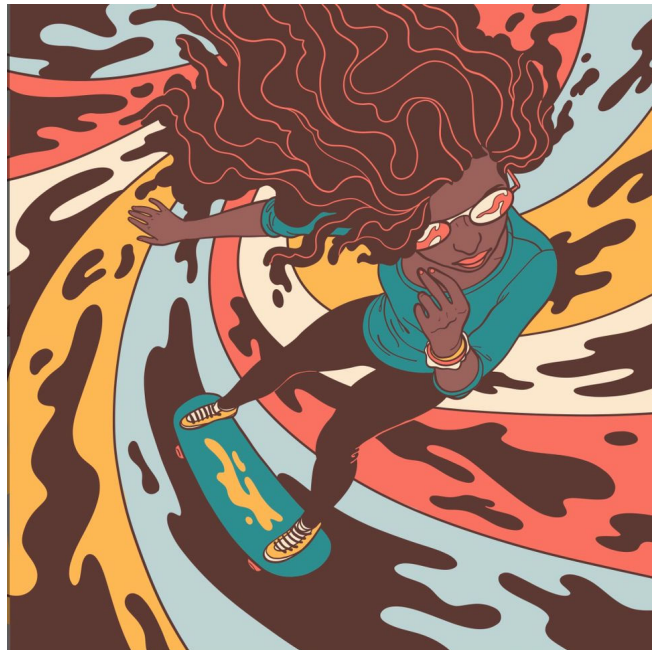
Painting 4: Vector Brushes