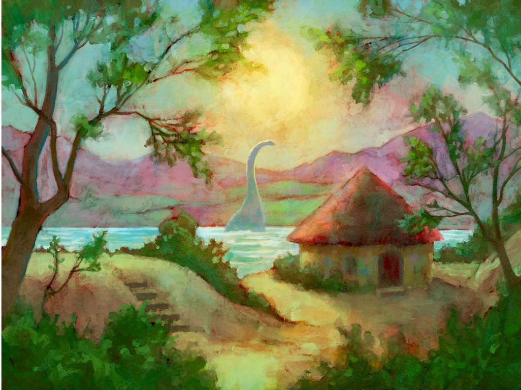
Painting 3: Photoshop Brushes