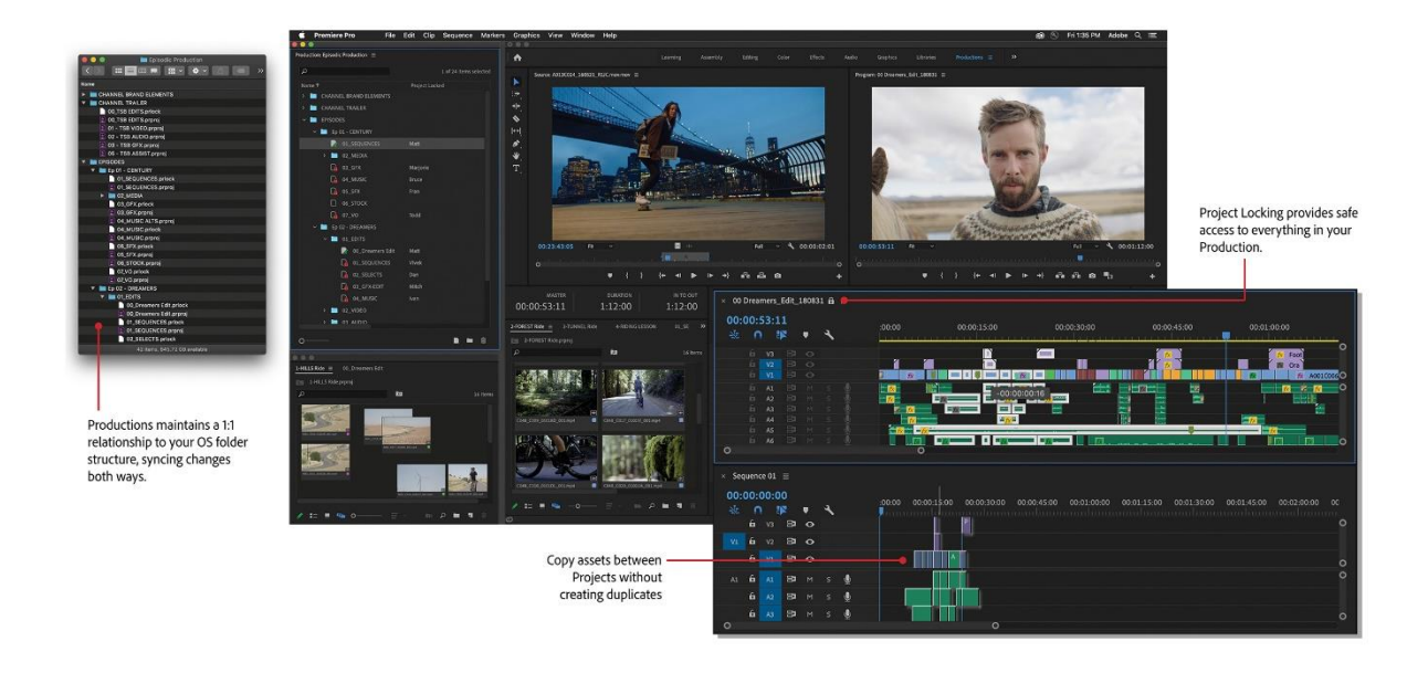
Image 2: The Productions panel gives a bird's eye view of all the projects and shows who is working on what.

The Productions panel gives a bird's eye view of all the projects and shows who is working on what so the whole team can track the progress.