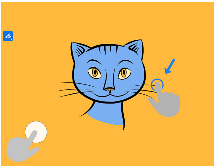
Art by Kyle T. Webster.

Vector Trim, a set of trim tools in Fresco, makes it easy to cut or completely remove vector strokes that cross or connect or intersect. Users can erase a stroke entirely with just three simple swipes.