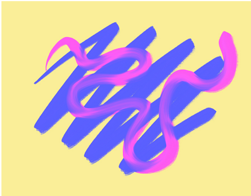
Art by Elissa Welsh.

Twelve new Mixer brushes are added to Fresco's default brush set. For supporting them, Photoshop's Mixer brushes will work in Fresco too. Users can watch the colors pick up, mix, and combine like paint on canvas.