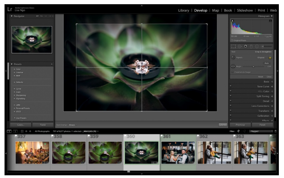
Image 3: The newly added centered crop overlay is particularly useful when using a square crop or bringing attention to the center of frames.