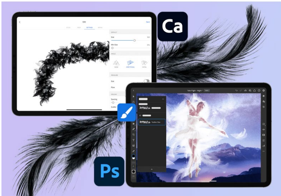
Image 1: Users can make their own strokes on paper or turn any photo or object into a custom brush.