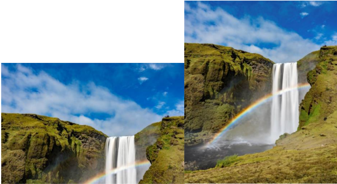
Before using Generative Expand (Left) and after using Generative Expand (Right)

As mentioned, Generative Expand allows users to seamlessly expand images using the Crop tool. Suppose your subject is cut off, your image is not in the aspect ratio you want, or an object in focus is misaligned with other parts of the image --- you can use Generative Expand to expand your canvas and get your image to look like anything you can imagine.