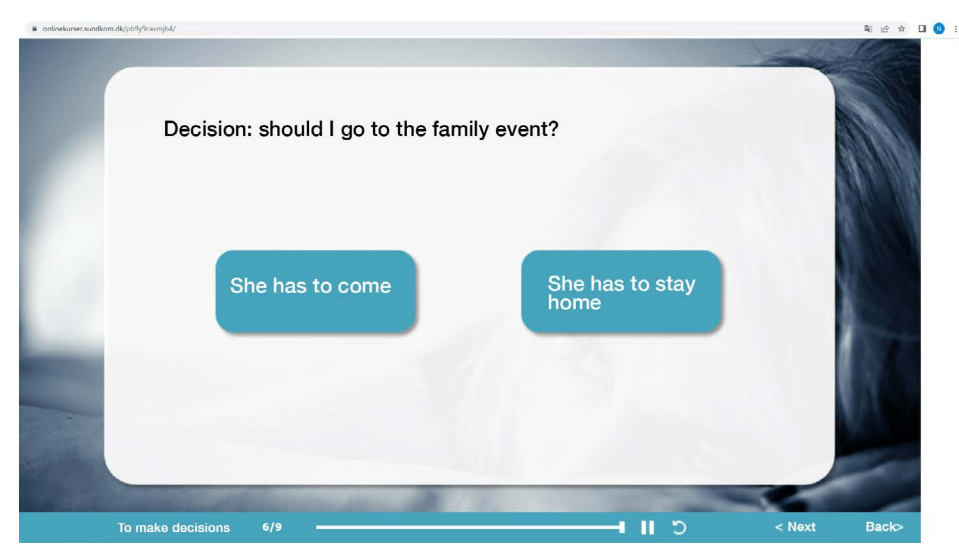
Example of an individual DCHE e-learning activity using Adobe Connect.

Participants log into Adobe Connect any time before a group session to complete an individual learning activity. The activity might involve video, slides, or quizzes. For instance, in the first session for people dealing with chronic illnesses, participants are asked to type into text boxes and submit any challenges that they face during daily life due to their illness. Since this learning portion is self-directed, participants can log in and complete the activity when it's convenient for them.