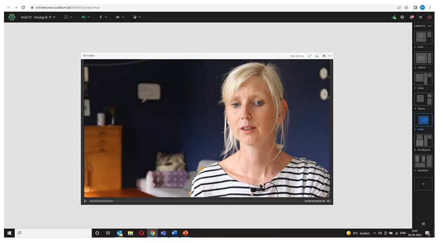
A video layout in Adobe Connect is used for seamless video streaming during live DCHE group sessions.