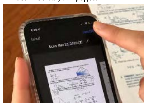
Tap Save PDF when you're done.