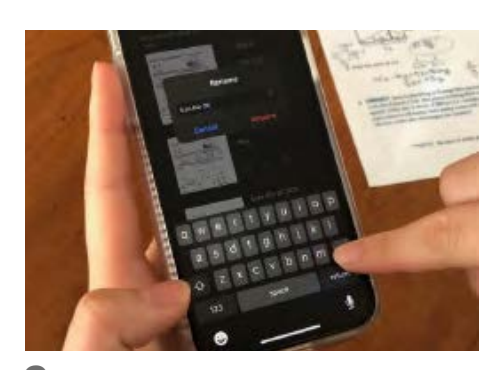
8 You can now rename your PDF.