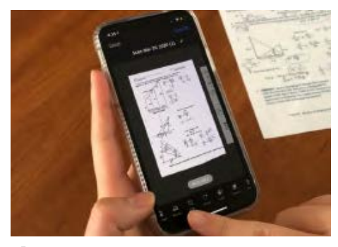
4 If you have another page to scan, repeat Steps 2 and 3 until you have scanned all your pages.