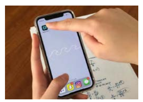
Install and open Adobe Scan on your device.