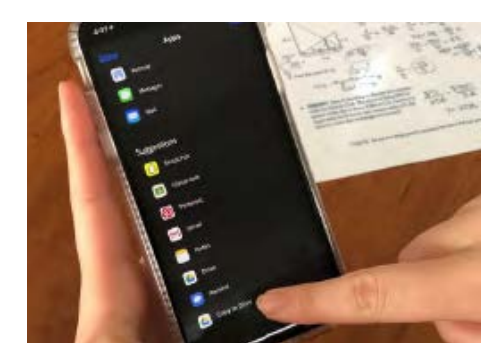
9 Share or save your file to Google Drive, Dropbox, or your computer.