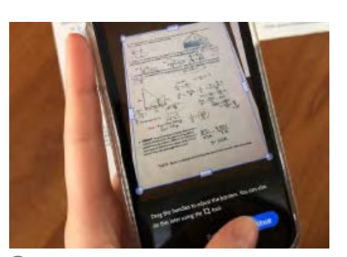
3 After scanning, you can adjust the borders of your document.