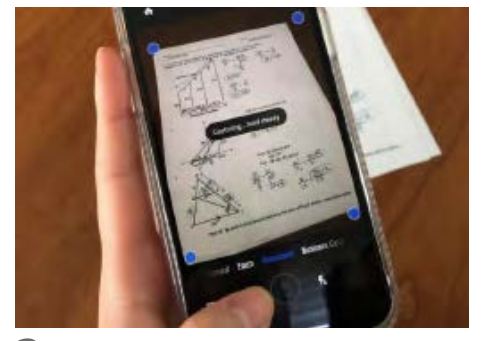
2 Hold your device steady above a file until the scan is captured.