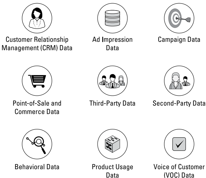
FIGURE 4-1: Tracking all your data sources.

Be sure that you have integrated all your data from disparate sources as shown in Figure 4-1, so that no insight is left behind.