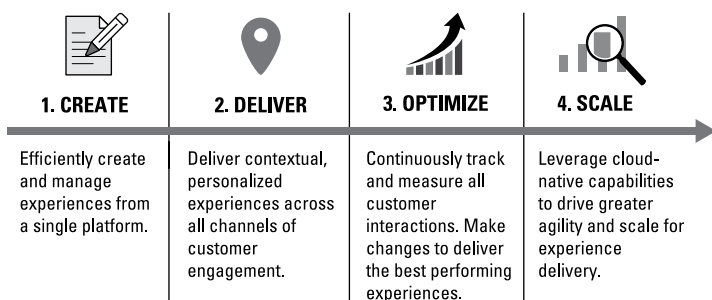
FIGURE 1-1: The Digital Foundation Model lets brands create, deliver, and optimize digital experiences at scale.